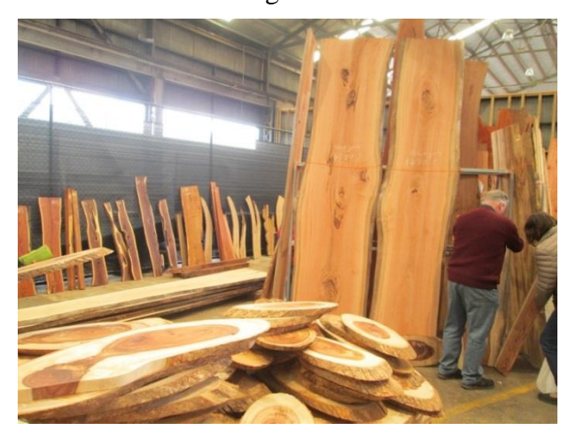
All that Timber!