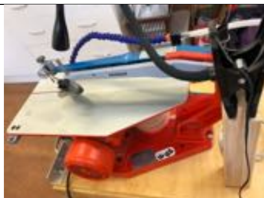
A side view of the scroll saw.