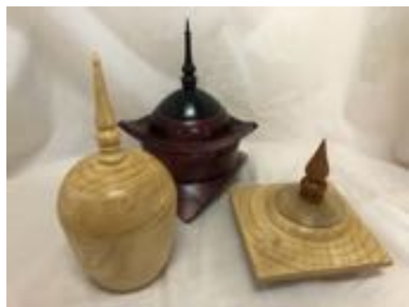
Peter Fisher been very busy making boxes. The small cylinder shape is made from Hibiscus and the rest are from Ash. Stains have been used on some of the boxes.