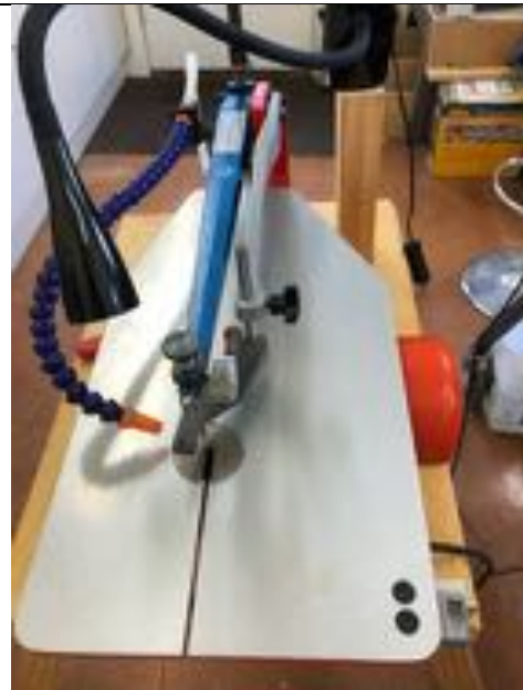
The quick release clamp is the silver coloured knob and the hold down is the dark grey arm near the blade.