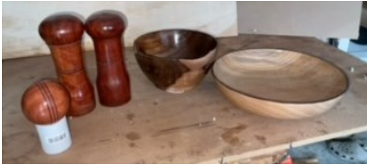
Red gum crush grinds ,Blackwood bowl, Lemon Scented Gum ball, all made by Neil Lenne