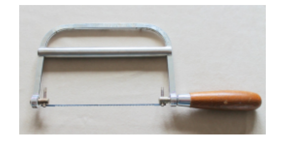
April 2017 No. 236 Page 3

Bob also showed a modified coping saw with extra frame stiffening. Allows the blade to be much tighter and lasting longer. It is also helps to put the blade in backwards, cutting on the pull stroke.