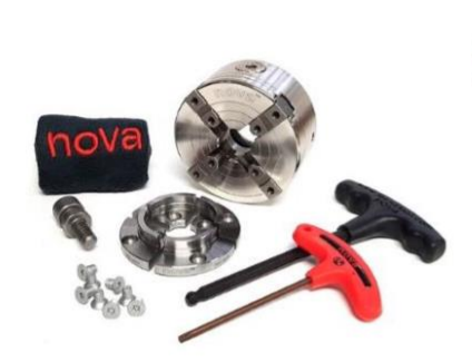
nova NOVA SN2 PRO-TEK CHUCK TK-SN2-PT