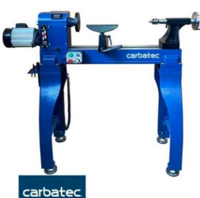
CARBATEC DELUXE ELECTRONIC VARIABLE SPEED LATHE WL-1624P