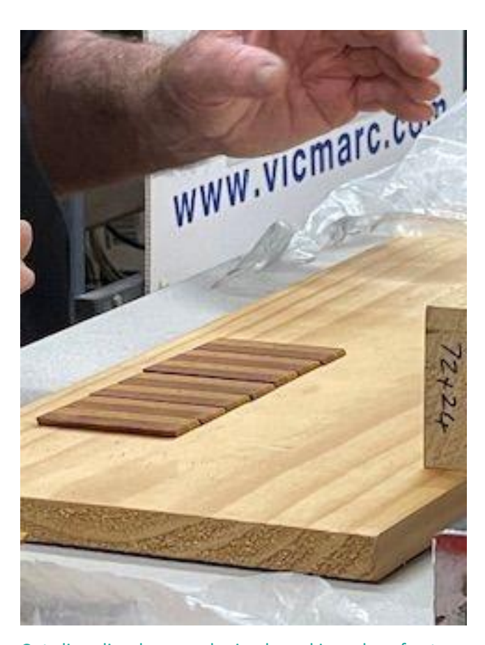
Cut slices lined up on glueing board in order of cut