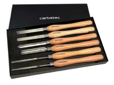
CARBATEC CRYOGENIC LARGE WOODTURNING CHISEL SET - 6PC CT-WTC-6CT-CRYO