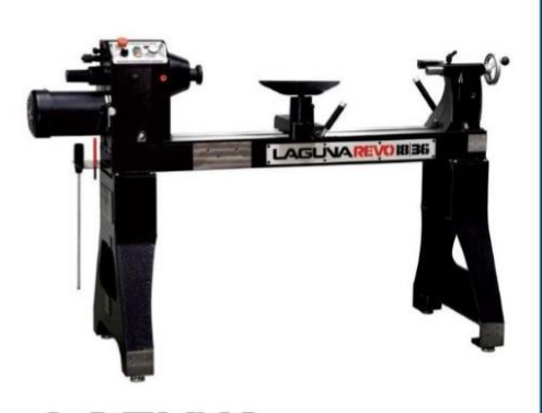
AGUVA LAGUNA REVO 18/36 LATHE LGT-REVO-1836

Visit your local store, carbatec.com.au or call 1800 658 111