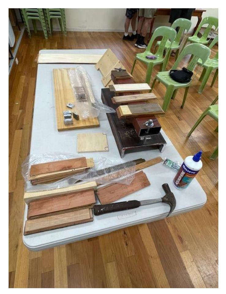
Laminated blocks prepared for slices using jig and bandsaw/dropsaw