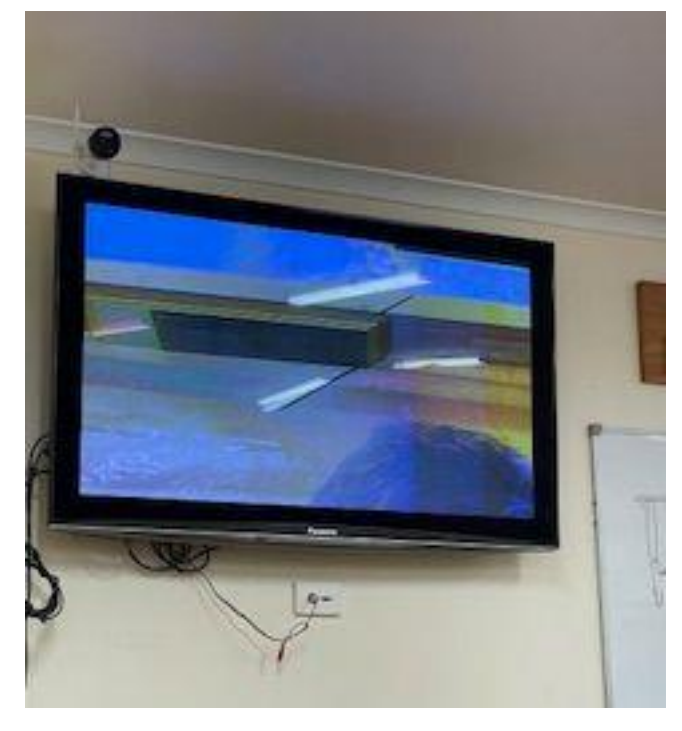
Placement of block tight against backboard for slicing