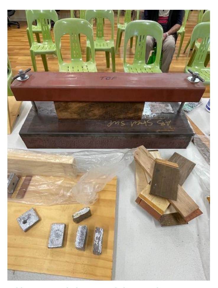
Table set out with the pre-made laminated blocks, cramp, gluing board, plastic and metal weight.