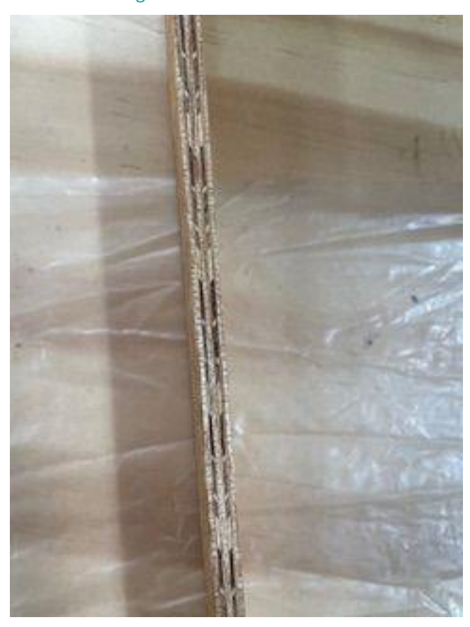
Ribbon prepared for final slicing to form a flexible band