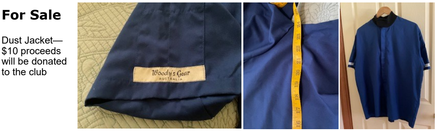
ALBURY-WODONGA WOODCRAFTERS Inc. 7