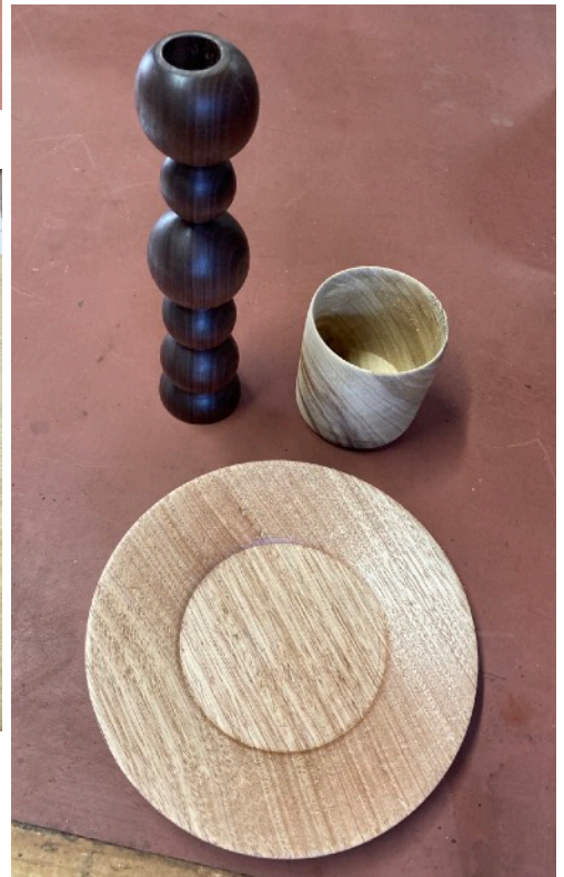
Steve's turned cup, candlestick, and plate