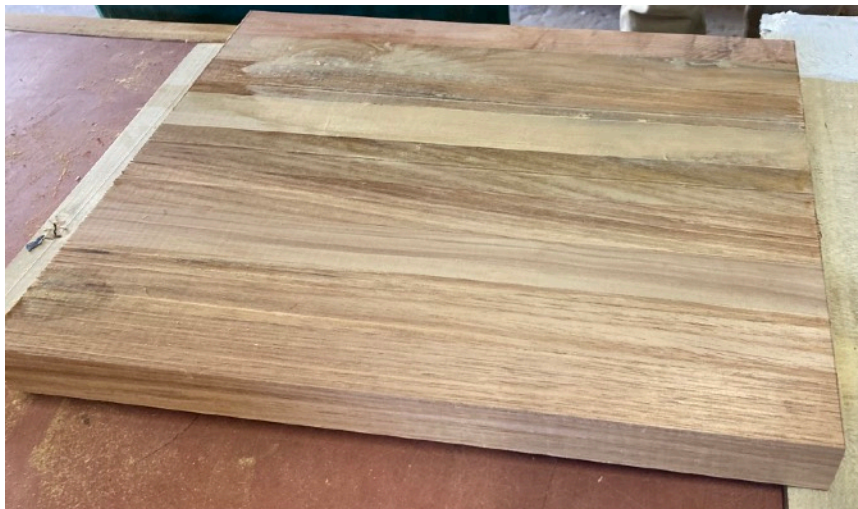
Garry's first attempt at a biscuited chopping board