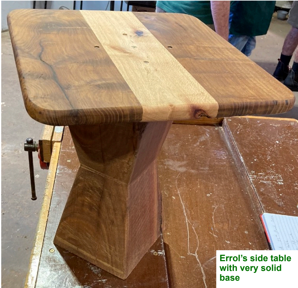
Errol's side table with very solid base