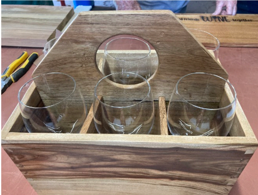
Errol's camphor laurel dovetailed wine glass caddy