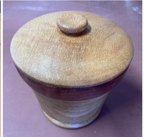
Les' lidded silky oak/redgum pot