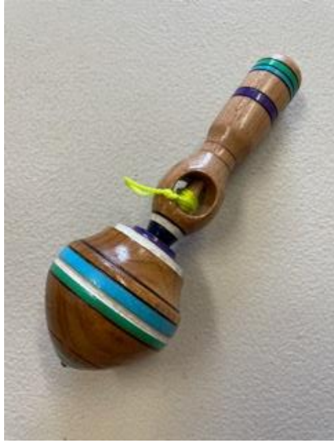
The Finished Top

The whole project is then given a couple of coats of polyeurethane to ensure that it shines.