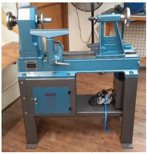
The New Lathe in Position

transporting the lathe and to those able bodied members who manoeuvred it into place. The lathe was funded by a Gambling Community Benefit Fund grant.