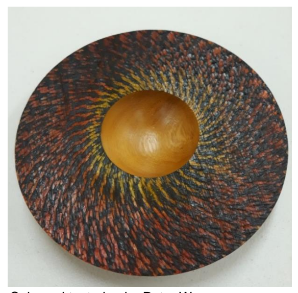
Coloured texturing by Peter Wyer