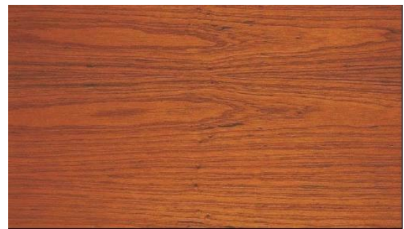
Red Cedar Timber Sample