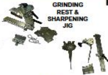
GRINDING REST & SHARPENING JIG

PROUDLY AUSTRALIAN MADE AND OWNED SINCE 1984