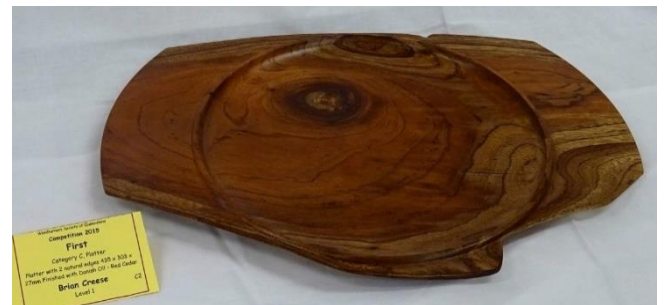
Red Cedar Platter by Brian Creese