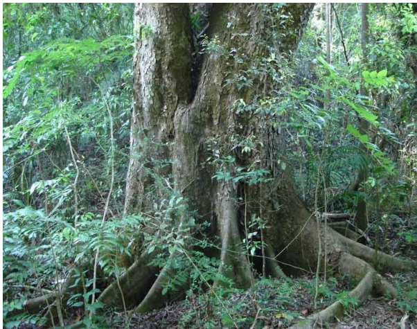
Red Cedar Tree

Botanical Name: Toona australis or Cedrela toona