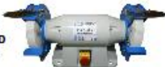
VICMARC SLOW SPEED GRINDER