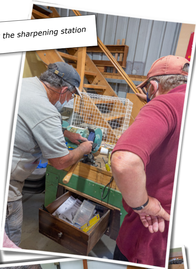
At the sharpening station