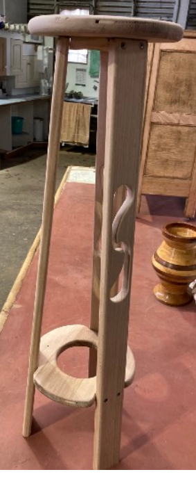
Steve's unfinished hall plant stand