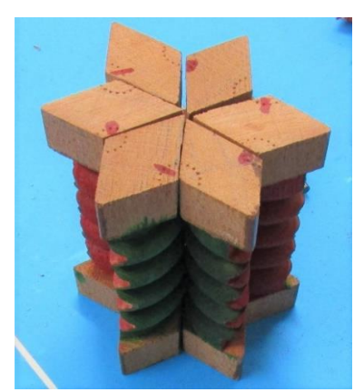
The 6 Diamonds Ready to Go

The processes described above would have been gone through for the second set of 3 blanks if Ian hadn't done them already at home. Well done Ian.