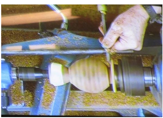
Ian Turns the Spigot on the Bottom

He used a small gouge to remove waste and shape the top and bottom diamond sections. lan turned a small spigot at the tailstock end. He removed the piece from the lathe and fitted a small scroll chuck. He mounted the blank into the chuck using the new spigot. The tailstock was brought up to provide support. Ian used a small spindle gouge, making increasingly fine push cuts. As the top got reduced and fragile lan wrapped some masking tape around it to provide support. Next, the masking tape was removed from the body of the piece and lan used the spindle gouge to refine the shape and remove waste. Once he was happy with the shape, he used a parting tool to create a small spigot just above the chuck jaws.