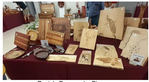
Rosie's Pyrography Pieces