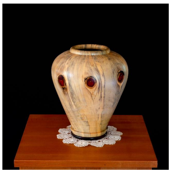
The Completed Vessel – Beautiful!!!

The end result is quite pleasing, but you do wonder if you should discard problem timber early in the project.