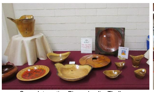
Some Interesting Pieces by Jim Thallon