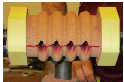
The 2<sup>nd</sup> Process in Progress

lan removed the blanks from the lathe, removed the masking tape, disassembled the blanks, removed the double-sided tape, and then rolled the blanks over. He reapplied the double-sided tape and reassembled the blanks so the turned surfaces were at the centre of the bundle. The masking tape was reapplied at the top and bottom, and the blanks were remounted on the lathe as above. The process described in the previous paragraph were repeated with the following differences. Ian reversed the order of the beads and coves, and he used green dye.