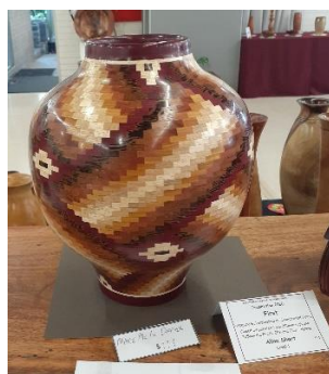
An Allan Short Special – Over 2 Thousand Segments