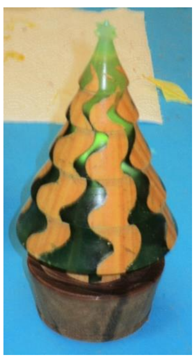
Ones with an LED Light & Resin in the Gaps

The assembled members were very impressed and amazed by lan's demonstration and gave him a hearty round of applause, and favourable comments and questions. Very well done lan. I look forward your next demonstration. I'm sure it will be something equally as challenging.