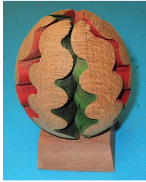
The Completed Piece

At this stage Ian posed the question a number of us were thinking, i.e., that was interesting but does it have any practical uses? The following are a couple of answers.