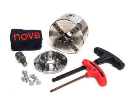
nova NOVA SN2 PRO-TEK CHUCK TK-SN2-PT