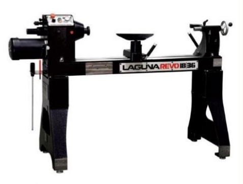
AGUVA LAGUNA REVO 18/36 LATHE LGT-REVO-1836

Visit your local store, carbatec.com.au or call 1800 658 111