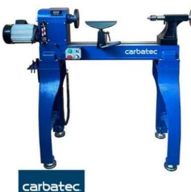
CARBATEC DELUXE ELECTRONIC VARIABLE SPEED LATHE WL-1624P