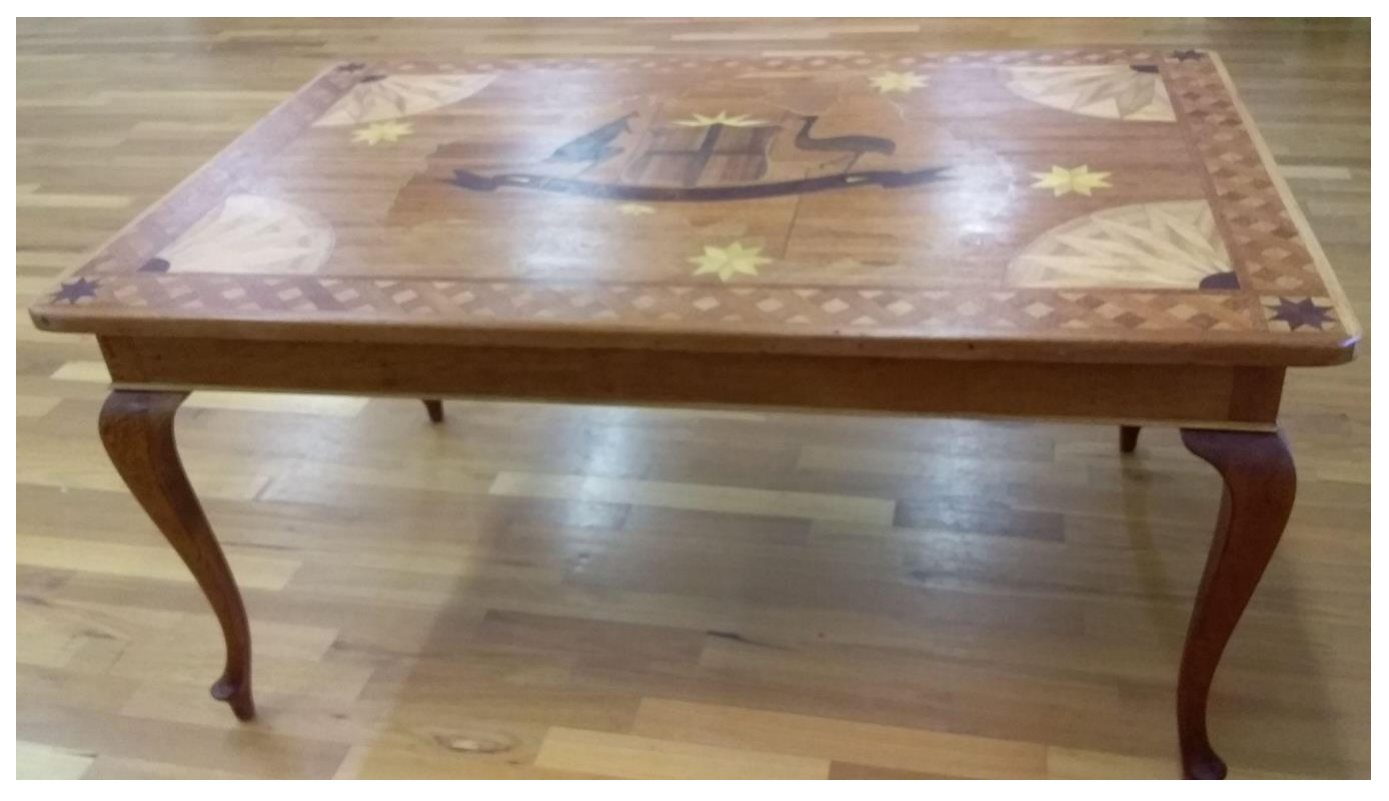
Restoration complete (May 2024)

The table top, rails and legs were than sanded by hand to 400 grit, followed by application of Rustin's Danish Oil – four coats on top and two coats for the rails and legs. U-Beaut Traditional Wax was used as a final finish. The restoration work and finishing has finally been completed after almost 10 years, the table will be transported to Brisbane City Hall, where its glass top is currently being stored. The table with glass top will eventually will be displayed in the Fifty Plus Community Room on the Basement Level of City Hall.