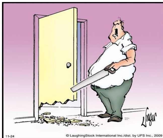
"That should clear the rug."