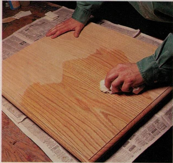
Wax is not as durable as other finishes. Use it on objects that aren't frequently handled or as a polish on top of another finish.

Commercial wax is sold in liquid and paste forms and can be a single wax or a blend of waxes. A wax finish adds shine to wood without darkening it. Wax is too soft and porous to be scratch or water resistant so it is not advised for use on items that will be regularly handled. It is excellent as a polish on top of another finish, however.