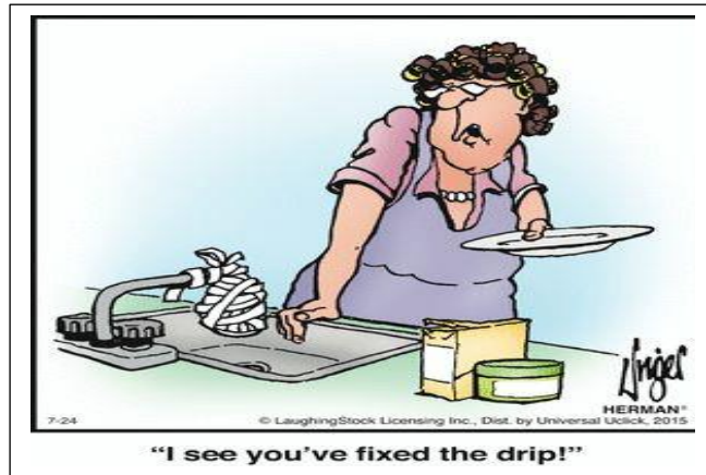
"I see you've fixed the drip!"