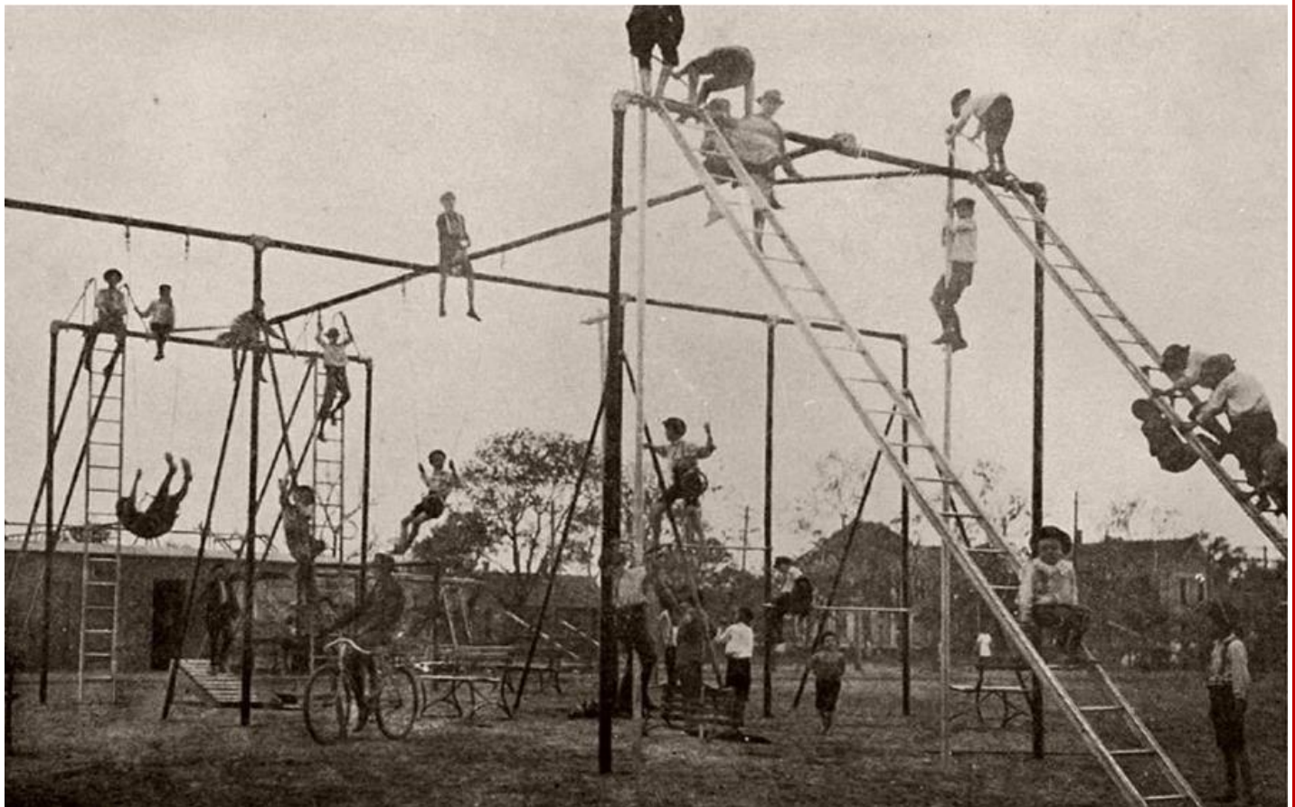
Children's playground in 1900's – the good old days!