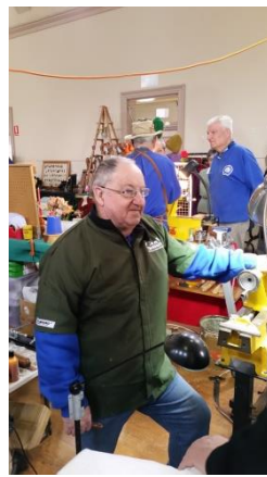
On a mission?