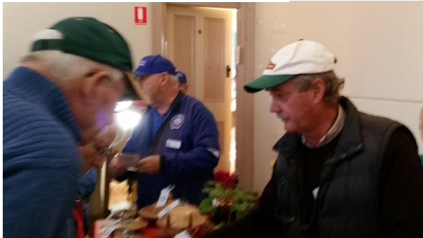
Deep in discussion.