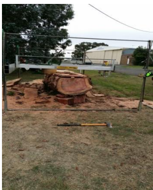
The Mill in place.