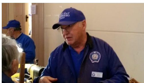
That's just how we do it, Madam!