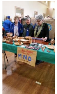
Our MND volunteers