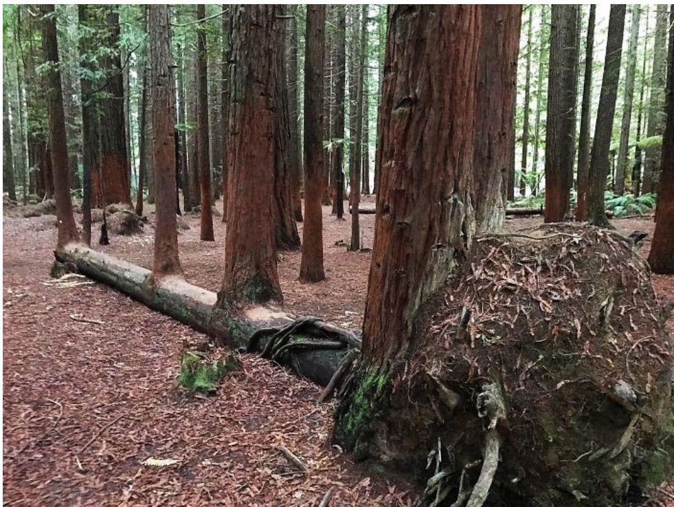
A tree for four trees