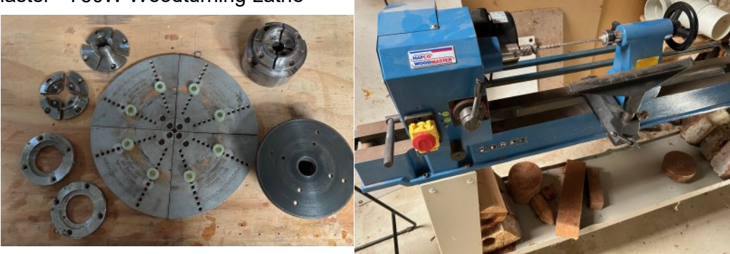
ALBURY-WODONGA WOODCRAFTERS Inc. 13

Call Ken Blowers on 0409 795645 or email kenb001@bigpond.net.au