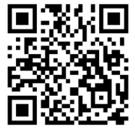
Scan QR code for socials