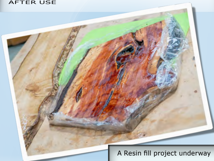
A Resin fill project underway