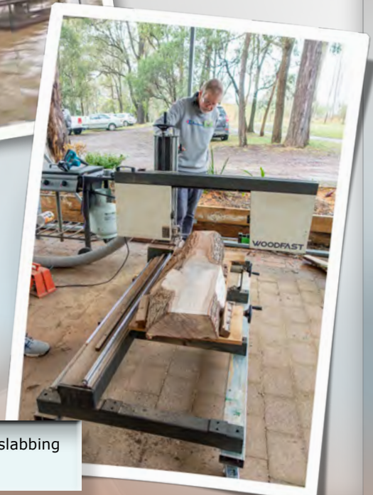
Tom Carr operating the new slabbing bandsaw