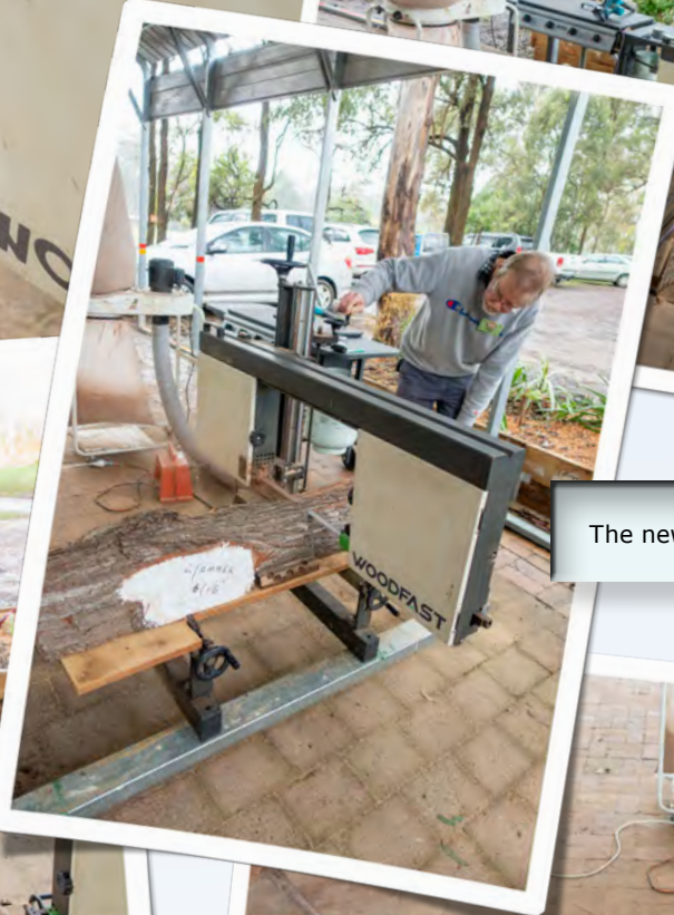
The new slab cutting bandsaw in use