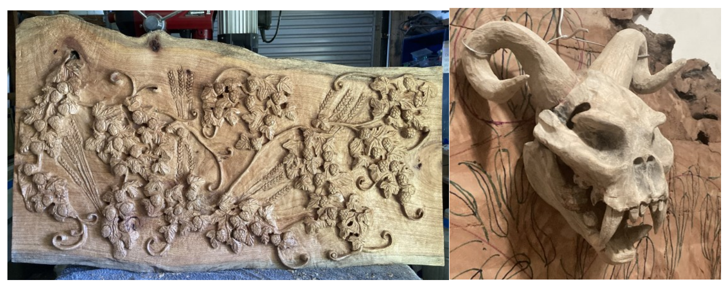
ALBURY-WODONGA WOODCRAFTERS Inc. 10

(R) Finished the monster skull, all power carving, jaw, skull, teeth and horns were all separately carved and then dowel and glued.