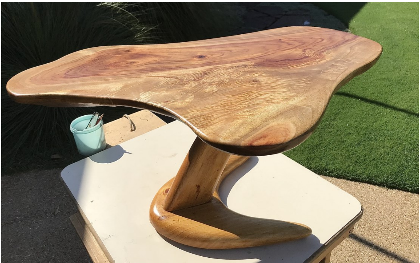
ALBURY-WODONGA WOODCRAFTERS Inc. 11

(Below) This is the slab of camphor laurel that Ross Graham flattened on the wood wiz for me to make a single leg table. The leg and base had to made from pine as no camphor pieces were available so a shellac finish was used to match as far as possible the table colour.