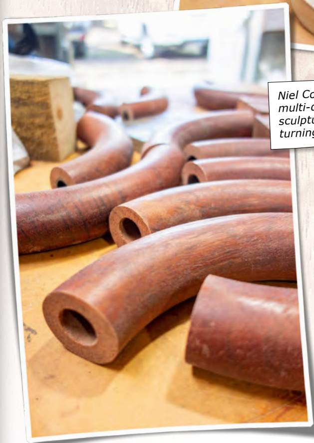
Niel Collier preparing a multi-discipline sculptural piece, including turning and bandsaw work