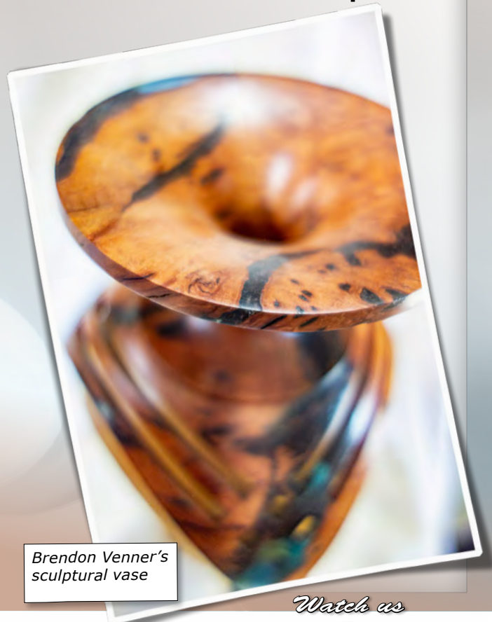
Brendon Venner's sculptural vase